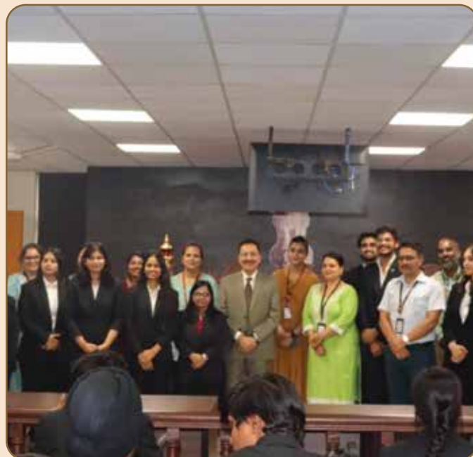
Moot Court Society at 4th Justice V.R Krishan Iyer Intra-Moot Court Competition, 2023

The Organising Committee (O.C.) shall be responsible for all administrative matters concerning the competition and shall supply and distribute all necessary information to the participating teams. The official email ID for all the correspondence is Solmootcourt@lpu.co.in