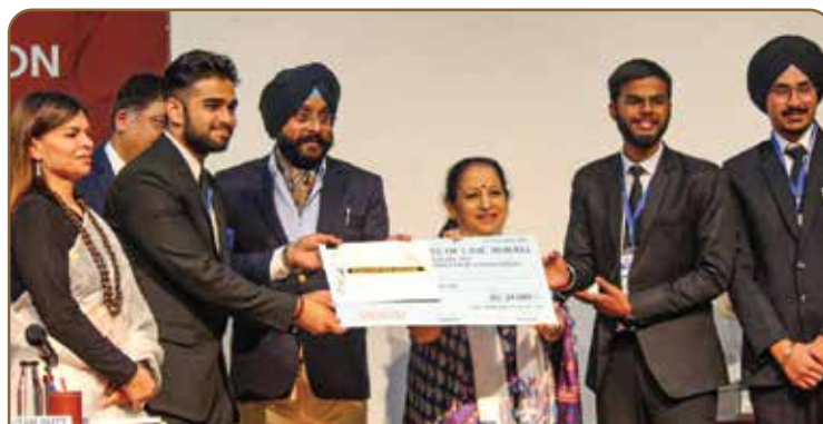
Team of LPU, Stood Runner-Up In 13th AIL Checkmate National Moot Court, 2023

Each team shall consist of three members, comprising of two speakers and one researcher. Any alterations in the composition of the team should be informed to organizing committee. It is the discretion of the committee to permit/reject such proposed alteration. However, any such alteration shall not be permitted without a satisfactory and reasonable justification, after the submission of memorials (Soft Copy). The inability of any team member to participate in accordance with the rules of this Competition shall lead to immediate disqualification of the team from the Competition.