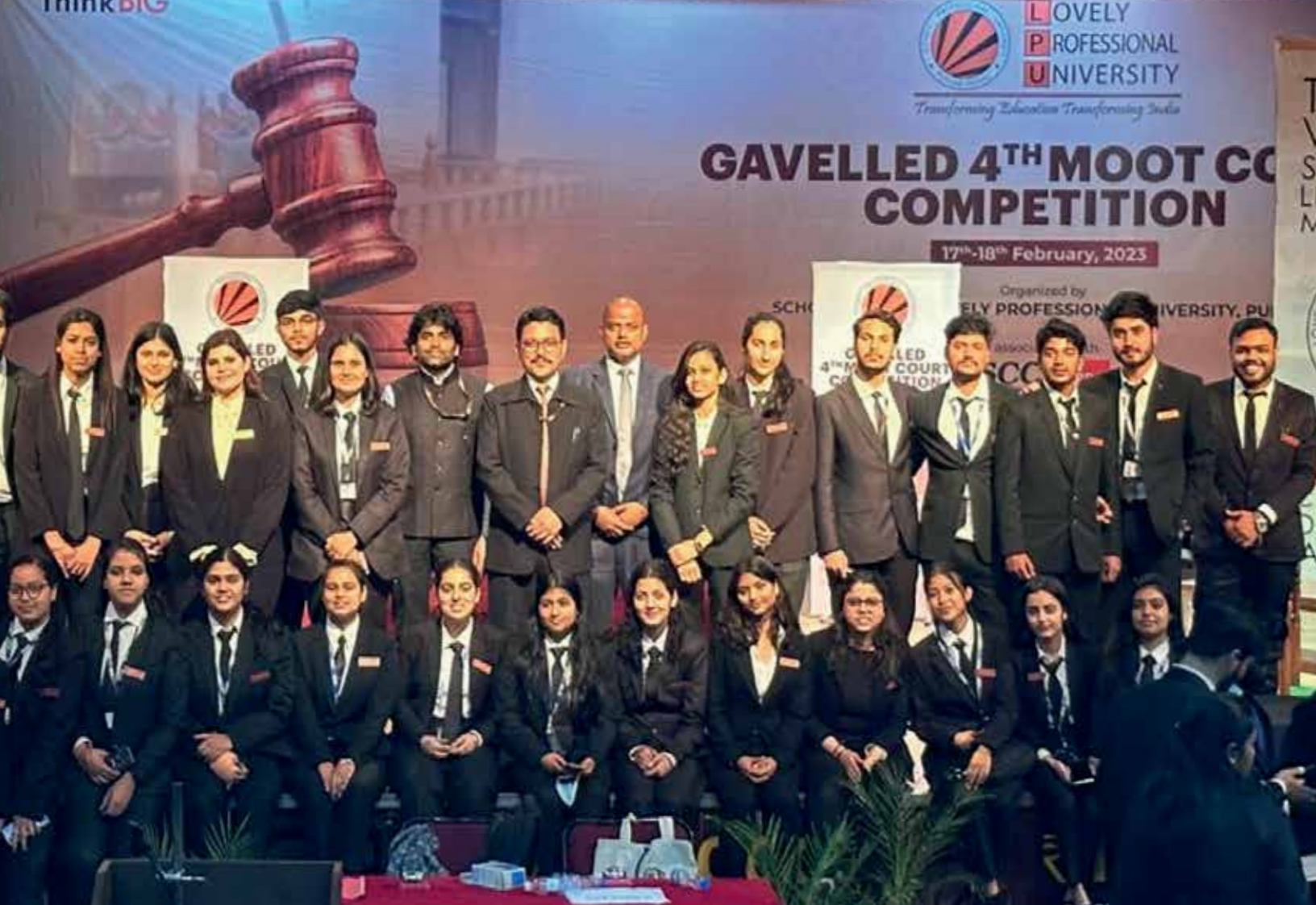
Glimpse of 4th Gavelled National Moot Court Competition; 2022