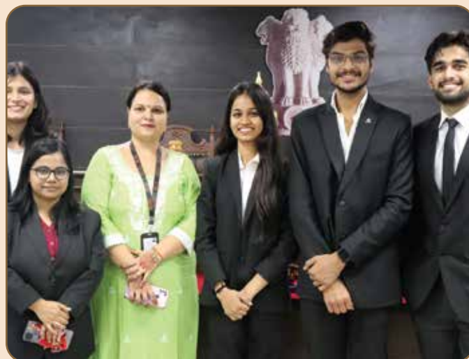
Office Bearers, MCS at 4th Justice V.R Krishan Iyer Intra- Moot Court Competition, 2023