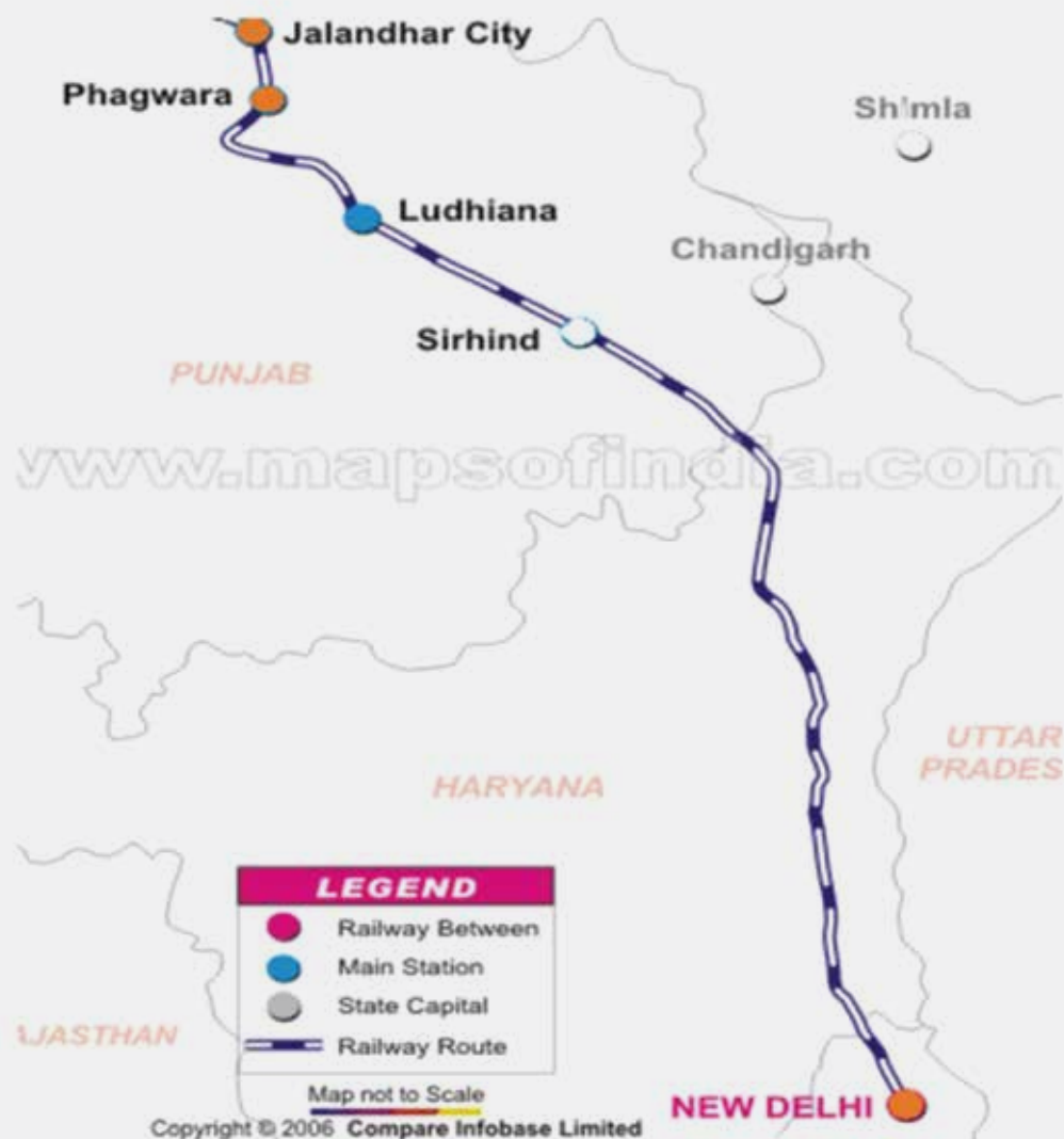
Map Route (New Delhi to Jalandhar)